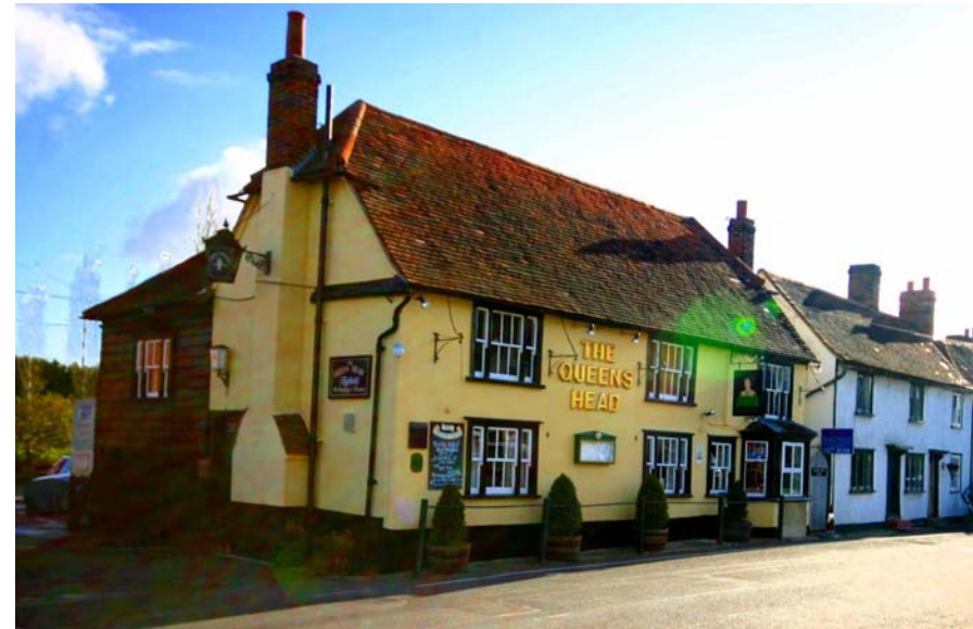
Queen's Head Public House, Fyfield

And finally, the residents of Fyfield without whom there would be no appraisal.