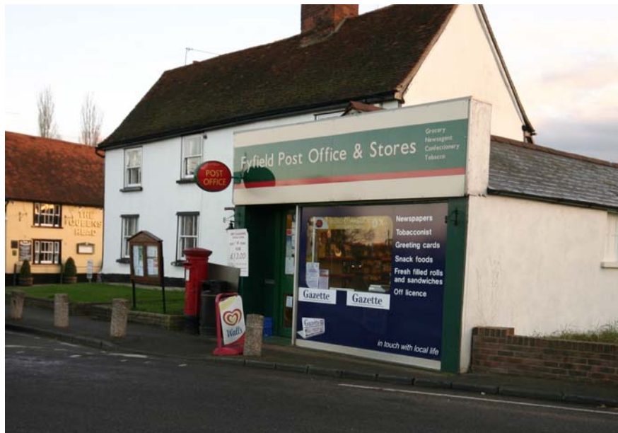
Fyfield Post Office & Village Store

The Village Hall to produce an action plan including a re-launch of the Village Hall and its activities. This will address the comments regarding cleanliness and decoration plus provide a programme of events and activities for 2008.