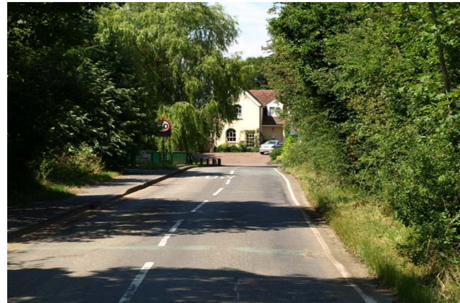
Willingale Road and Queen Street

On a more positive note, 77% knew who the Parish councillors were although 20% did not. In general, residents were happy with the way the Parish Council operates although some people thought that more candidates should stand for election giving residents a better choice of councillors.