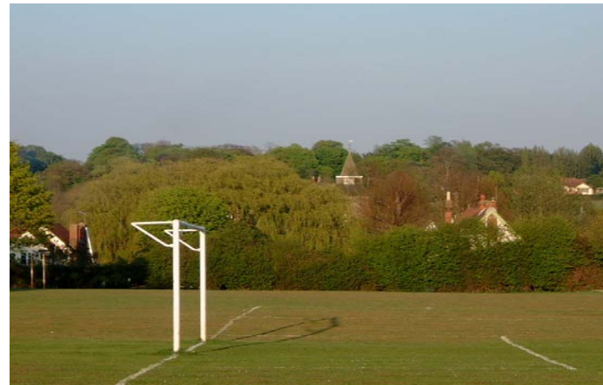
Sports Field & Church