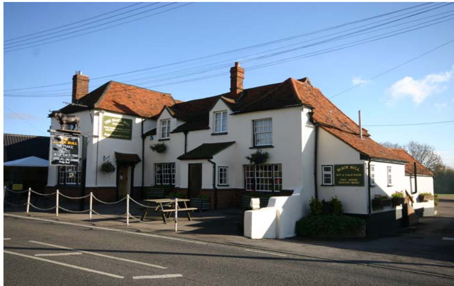
The Black Bull Public House, Fyfield