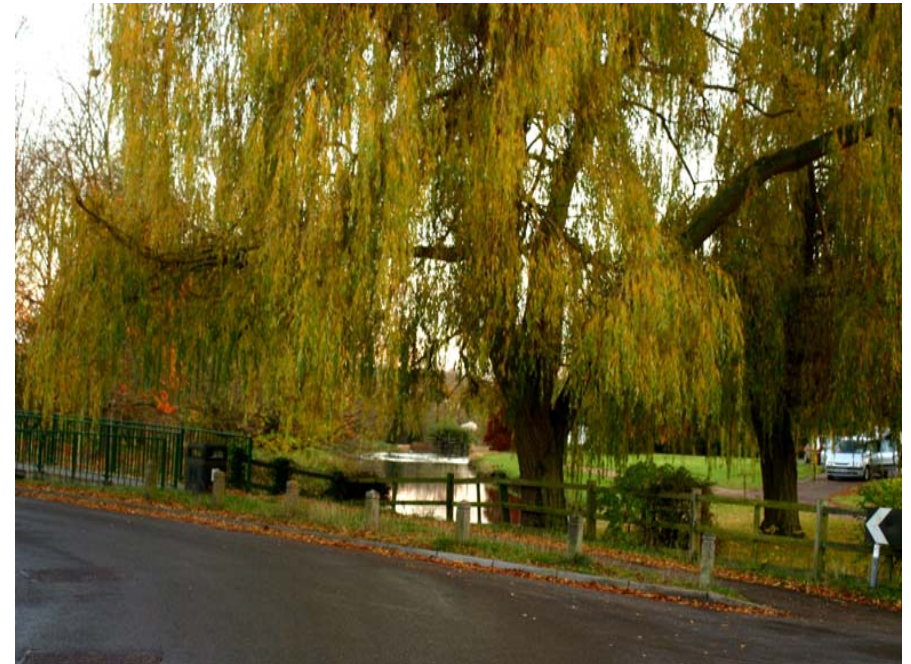
Autumn Willows in Fyfield

Action: The Parish Council should request the owners of the Gypsy Mead site to make an effort to keep the site in a tidy condition and support any plan to return the site to a restaurant.