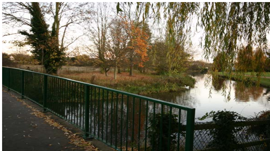
River Roding at the bridge on Willingale Road

The local bus service runs between Ongar and Chelmsford on a regular basis however, only 25% of the households make use of it. 2% use it daily, 8% weekly and 11% monthly. The main use is for shopping followed by recreation with school and work to a lesser degree. When asked how it could be improved 25% considered frequency could be improved and 7% thought the cost was too high.